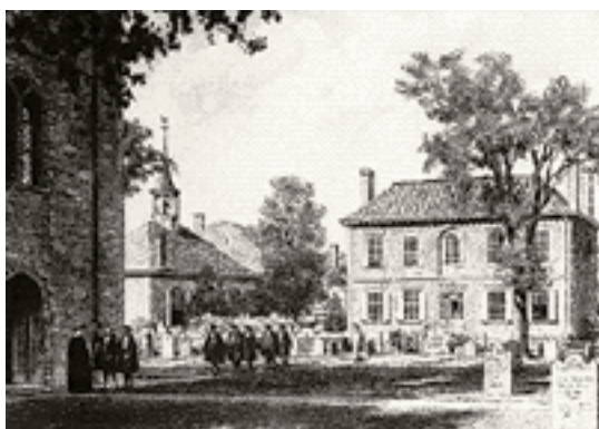
Columbia's first home, Trinity Schoolhouse

support the brightest Characters in all the elevated stations in life." One early manifestation of the institution's lofty goals was the establishment in 1767 of the first American medical school to grant the M.D. degree.