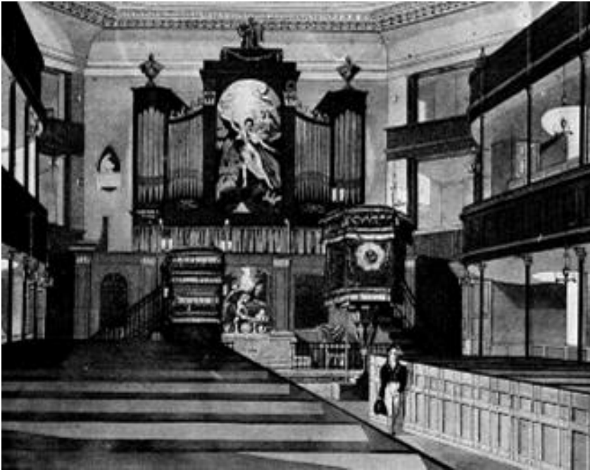
The J C Bishop Organ in 1817 (?)