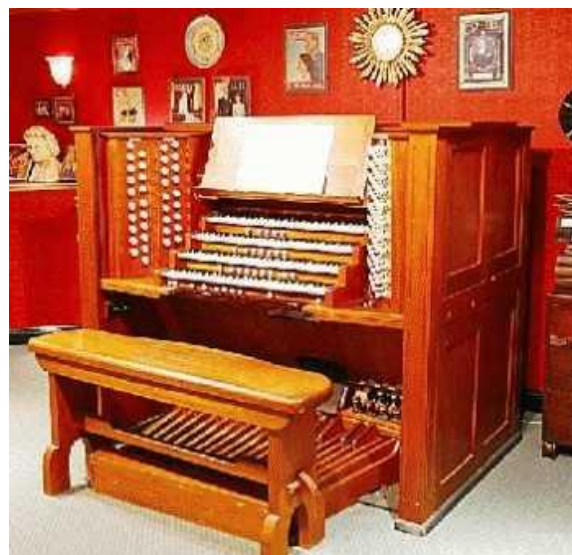
The St Marylebone Console at Burtey Fen