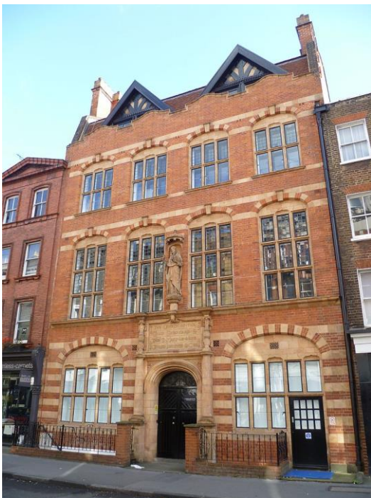
The Church of the Good Shepherd & The St. Marylebone Church Institute & Club is a grade II listed building in Paddington Street in the City of Westminster

£14; Ledger 11, pages 579/80; Shop Book 16, page 83