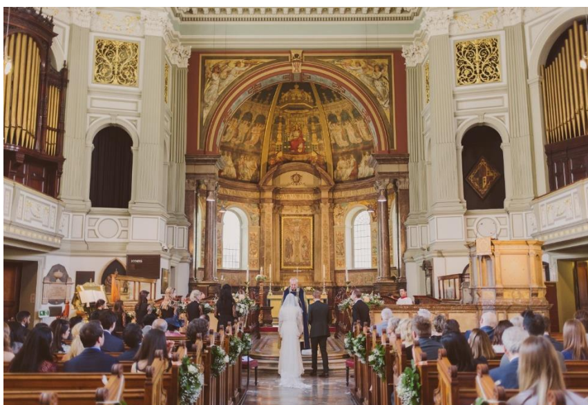
Davidson organ in situ

Some empty casework remains in situ in the parish church but is empty to the south east and south west.