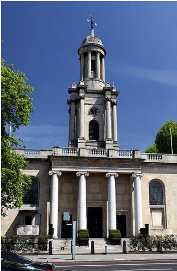
Holy Trinity from which the Schultz pipe work was transferred to St Marylebone and incorporated into the Gray & Davidson Organ

c. 1955 Schulze pipework from Holy Trinity, Marylebone incorporated into the Gray & Davidson Organ